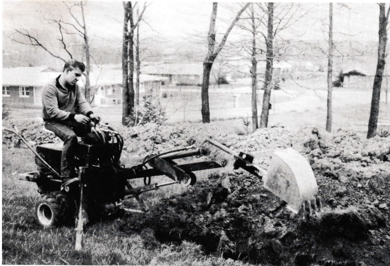
Reach out 6½ feet, get a full bucket every time . . . less move time, more dig time.